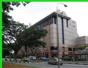
Tiong Bahru Plaza